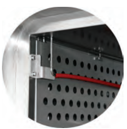
Pneumatic Door Locking System